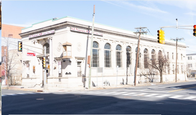
Corner of S. Broad St. & Market St.