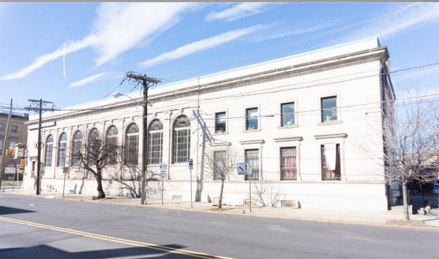
Rear View on Market St.