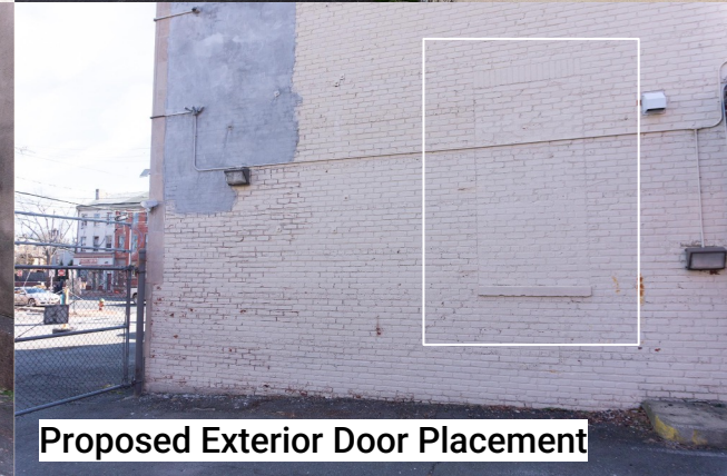
Proposed Exterior Door Placement