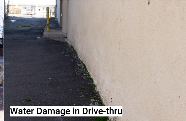
Water Damage in Drive-thru