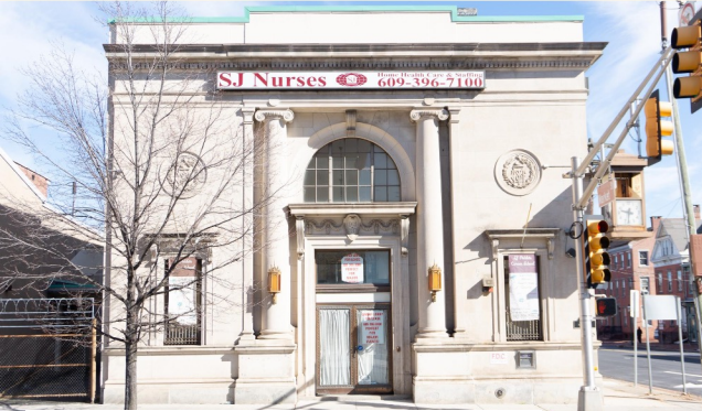
Front of building / Main Entrance