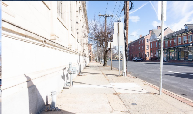
Sidewalk on Market St.