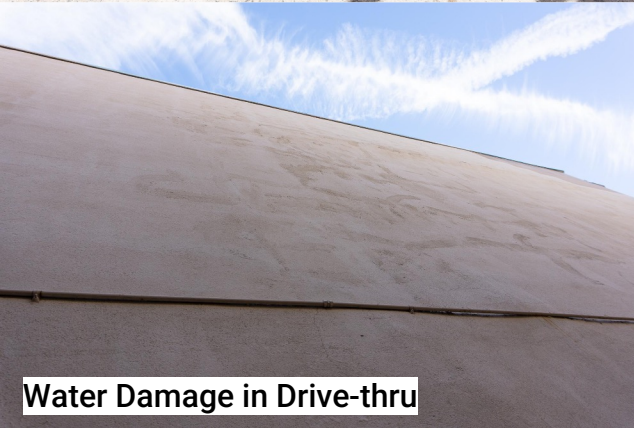
Water Damage in Drive-thru