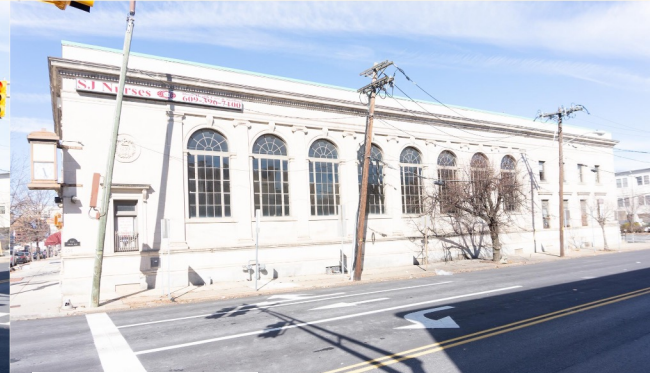
Market St. View