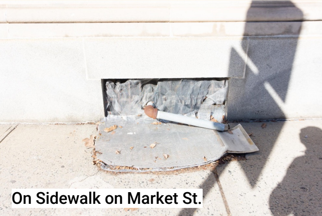
On Sidewalk on Market St.