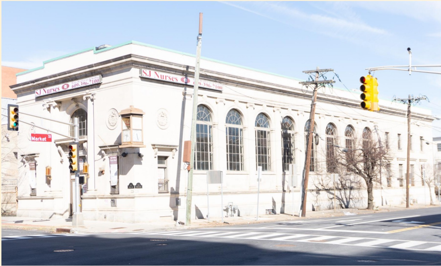
Clean Exterior of Building