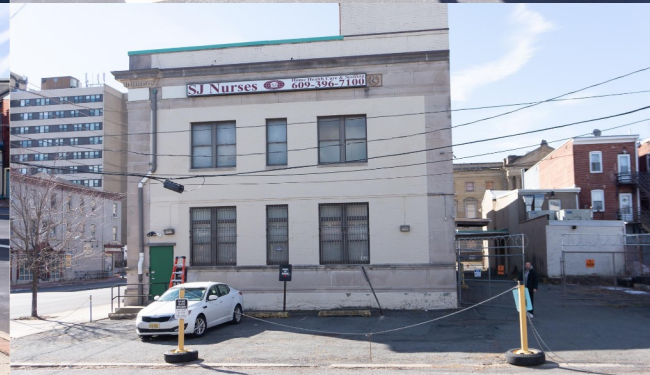
Rear of building / Onsite Parking