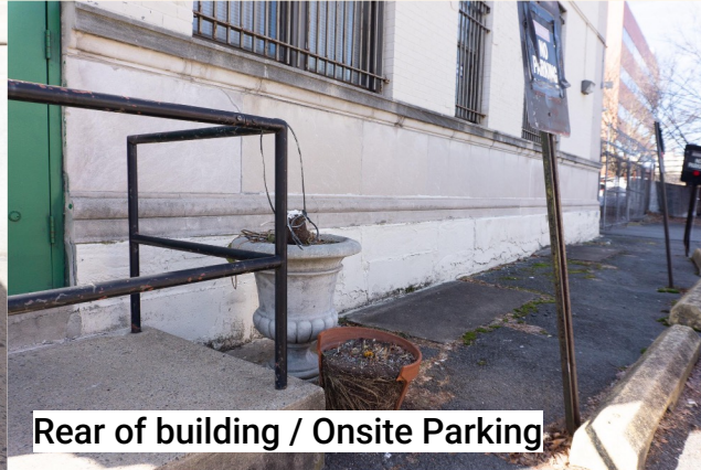
Rear of building / Onsite Parking